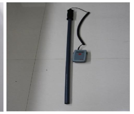
Fig. 4. Tag detector.

method was found to increase survival when compared to injecting tags into the belly with a syringe and plunger [4] (Fig. 3).