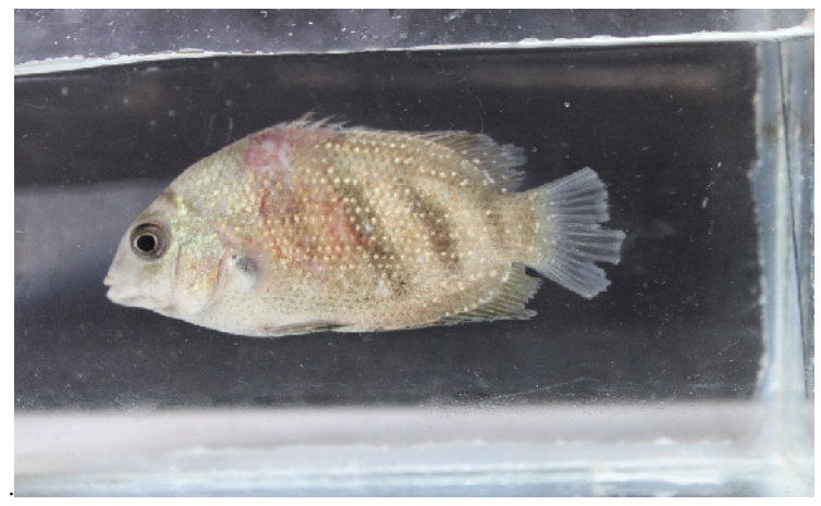
Fig. 6. Post-tagged mortality due to infection.