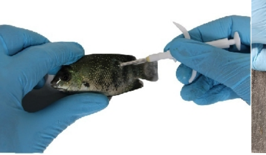
Fig. 1. Tagging using the injector.

The effects of the tagging process and the physical effects of tags on animal performance and health have been known to fisheries biologists [39]. Feasibility studies on tag assessment are highly encouraged when there is no detailed data on the individual species available, both to confirm findings and for ethical reasons, as physiological and behavioural responses to specific tagging procedures differ significantly between species [6, 64].